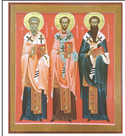
Top: A Greek icon of Basil. Beneath is an icon of the "Cappadocian Fathers": Basil, his brother, Gregory of Nyssa, and his best friend Gregory of Nazianzus.

Basil, with St. Pachomius, can be considered the father of communal monasticism in distinction to the solitary life of the hermit. He did not overlook the concerns of the world, but gave away his possessions to the poor and among the Greeks is referred to as "Father Christmas."