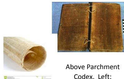
Above Parchment Codex. Left: Papyrus scroll