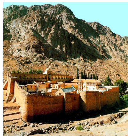
St. Catherine's Greek Orthodox Monastery, Sinai, Egypt. Founded in the 4 th century by Emperor Justinian I