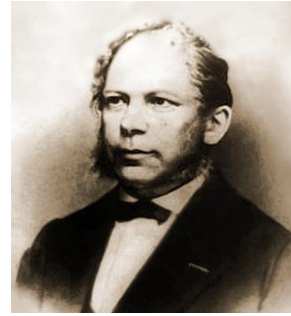
Friedrich Constantin von Tischendorf