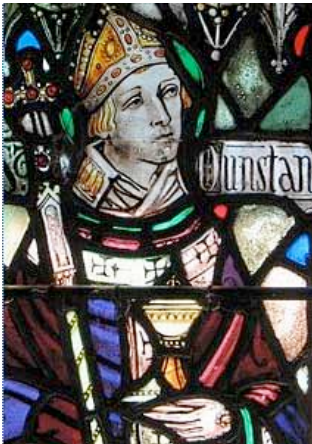
St. Dunstan, (909-998), Archbishop of Canterbury

of Christianity did Augustine bring when he arrived? Back to Bede: In the second book of his Ecclesiastical History , Bede writes of the encounter of St. Augustine with King Ethelbert of Kent: Within therefore some days hereof the king came unto the island, and sitting in an open place, he bid Augustine with his fellows to come to commune with him therein. For he would not, by reason of an old superstition, suffer him to come unto him in any house, lest, if they were skilful in sorcery, they might the rather by surprise deceive him and prevail against him. But they came not armed with the force of the devil, but with the strength of God, carrying before them in place of a banner a cross of silver and the image of the Lord Savior painted in a table, and singing the litanies, prayed the Lord both for their own eternal salvation and that of the as well to whom and for whose sake they had come thither Chapter 15). It was Orthodox Christianity, complete with the Holy Cross, icons, and ectenia (litanies). Nothing can be more representative of Orthodox liturgy than these! Orthodox Christianity now encountered the Celtic Christianity that had flourished in England up to St. Augustine's arrival in 595 A.D.