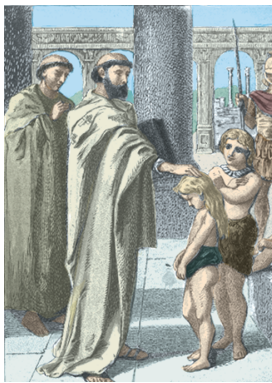
Deacon Gregory (c.540-604) and the slaves.

The famous story told by St. Bede the Venerable in the first volume of his Ecclesiastical History , tells of Pope Gregory the Great, before he held that office, first seeing “Angles” in the slave market of Rome.