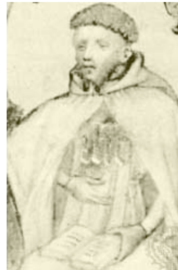
Richard Rolle of Hampole (1300-1349)

The Church was broken into clergy and laity. As the Norman barons spread Civil War, it affected the affairs of the Church as much as those of secular life. The Church lost its centrality in the life of the people. Many fled away from what became a capitulation to earthly government and societal divisions. They sought to find salvation in the mystical life of monasticism. The monks, the nuns, the hermits and lower clergy were drawn from the people. They came out of a society that had, for the most part, crushed and trodden them down. The spirit of Celtic/Orthodox England, already subdued by the Roman take-over at the Synod of Whitby in 664, was thus made slave to the feudal lords. It was forced to build castles and huge church constructions for the glory of kings and nobles. The great cathedrals were constructed in this era. Norwich Cathedral, for example, was begun in 1096 and was completed in 1145. Its final tower spire was added in 1480. These dates correspond with the dark era of Christian life in England. For many, these cathedrals represented human lust for power and earthly riches. Their spires groped heavenwards, towards the God that the people had known of old and could not find.