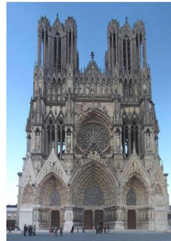
The Cathedral of Reims

Reims was the capital of the Remi tribe of Gauls until its capture ca. 80 BC by the Romans, who renamed it Durocortorum. Christianity, predominately Arian, was established in the third century, and by this time the name of Reims seems to have been used with the founding of the Diocese of Reims. In 406 the Vandals took the city, slaying Bishop Nicasius, and in 451 Attila the Hun descended upon Reims.