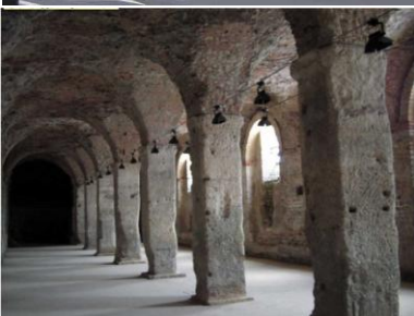
Roman Ruins at Reims: Above: Porte de Mars, triumphal arch. Below: The only surviving portion of the Roman Forum, now underground. (Jean-Pierre Riocreux)

From the 12 th century Reims was the site of the coronations of the kings of France. A politically designed coronation was that of Charles VII in 1429. According to legend, Joan of Arc thought this would symbolize France's determination to regain territories held by the English. The original cathedral was burned in 1210. Reims and its cathedral were severely damaged in World Wars I and II, but were rebuilt and remain tourist attractions. Today, the cathedral's nave is longer than that of Chartres.