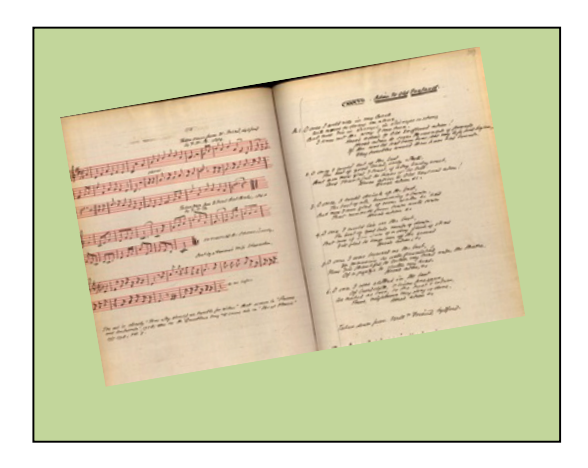
'Adieu to old England adieu' from a portion of a songbook in the Baring-Gould manuscript archive.